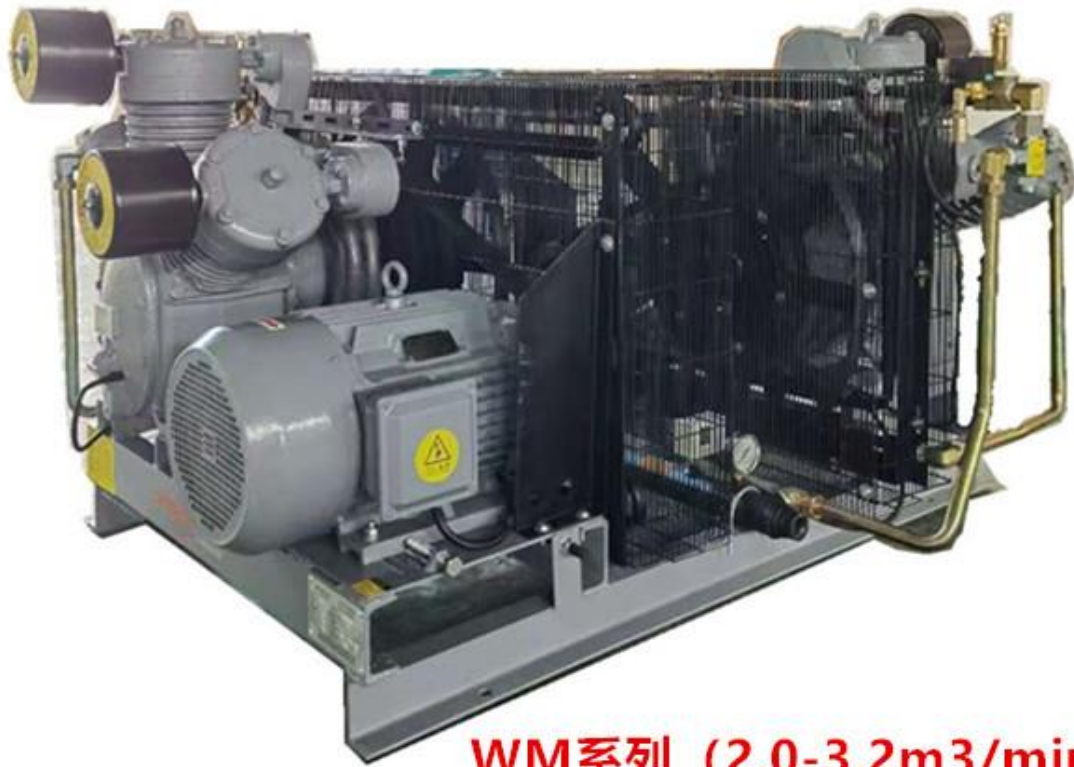
WM系列 (2.0-3.2m 3 /min)